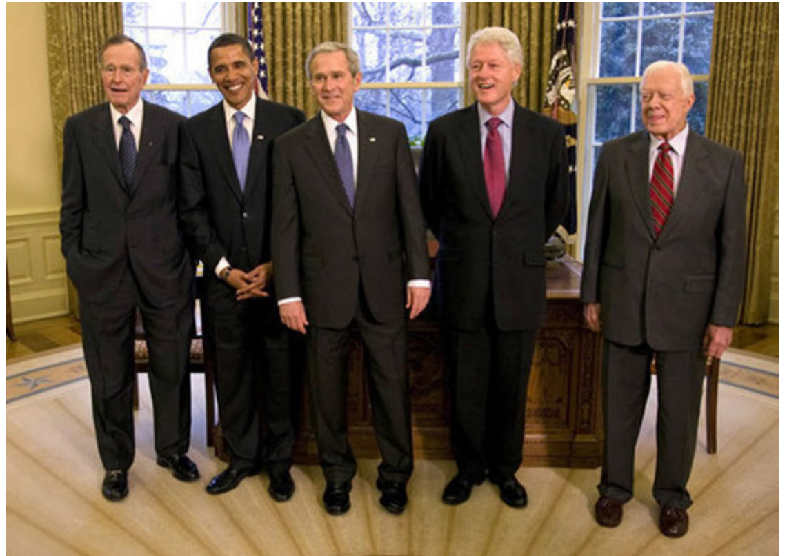
Five United States presidents from left to right: George H.W. Bush, Barack Obama, George W. Bush, Bill Clinton, and Jimmy Carter.

Some rights reserved. https://creativecommons.org/licenses/by/2.0