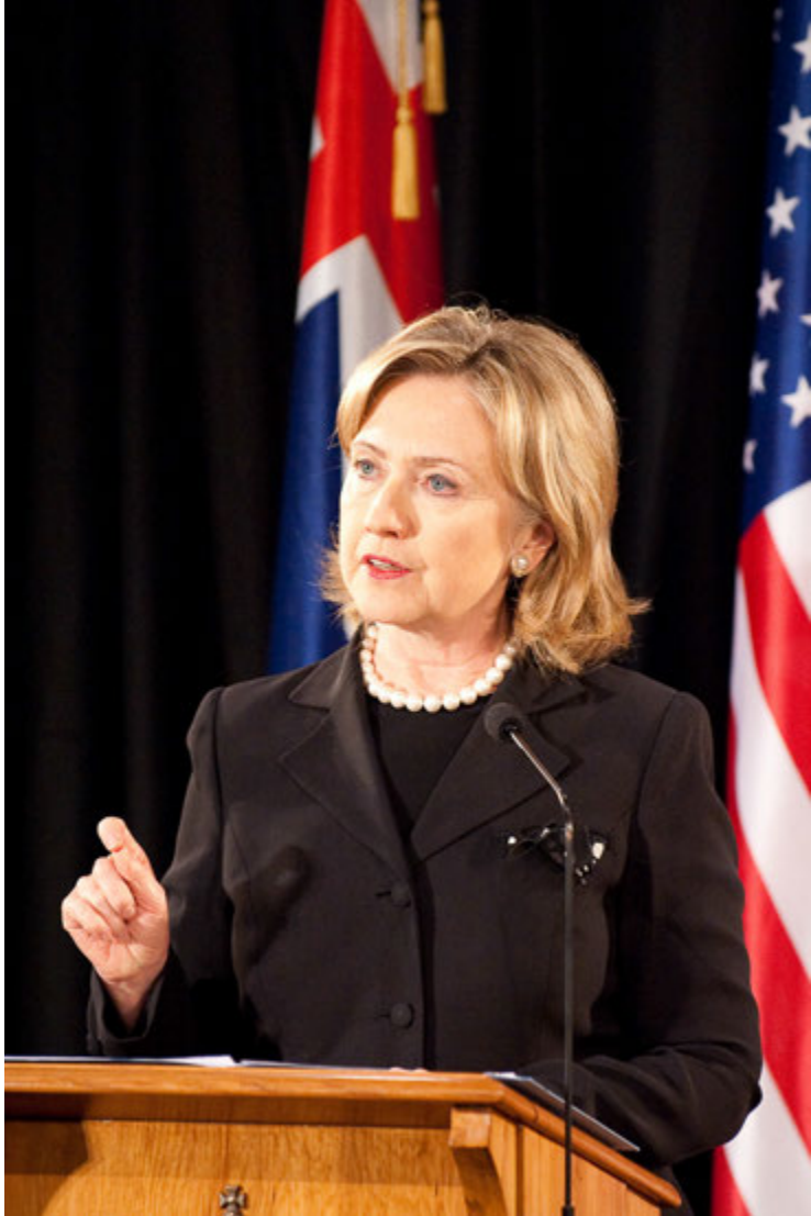
Former Secretary of State Hillary Clinton

©2010 by US Embassy at Flickr. Some rights reserved. https://creativecommons.org/licenses/by-nd/2.0/