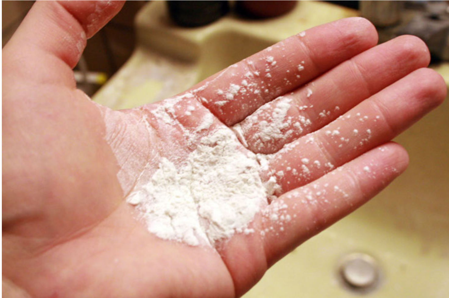
Powder on a person's hand